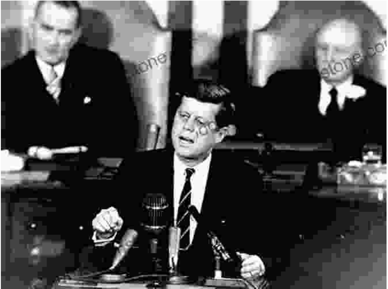
John F. Kennedy giving a speech.

These are just a few of the many real stories from history without the fairy tale endings. These stories remind us that life is not always fair, and that even the greatest achievements can be overshadowed by tragedy. However, these stories also inspire us to persevere in the face of adversity, and to never give up on our dreams.