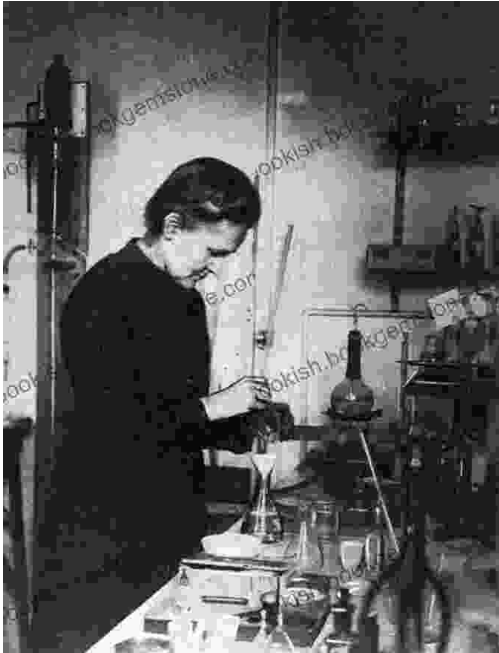
Marie Curie in her laboratory.